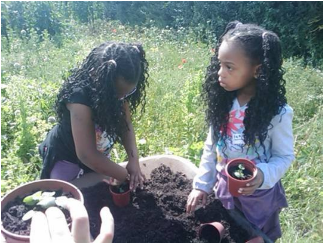
Summer Project – Building Bird Houses at local Allotment